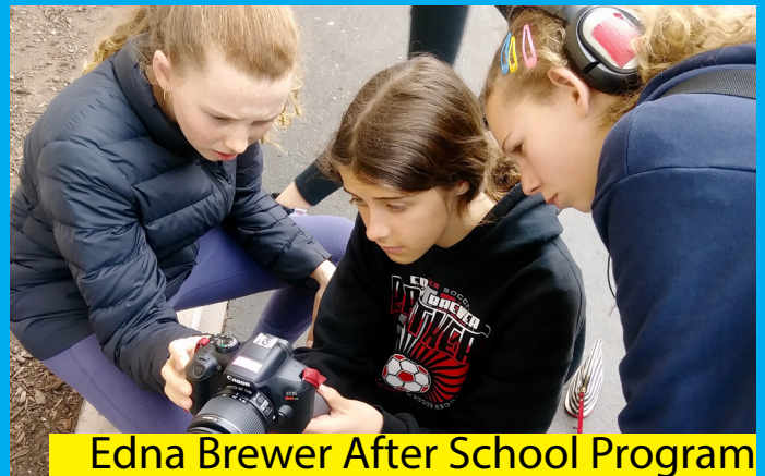
Edna Brewer After School Program

Club Reel Stories: Reel Stories curriculum for teenagers at Oakland Tech and Dougherty Valley High School.