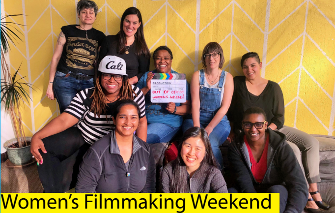
Women's Filmmaking Weekend

More than a summer camp! In 2019, Reel Stories hosted year-round programs, workshops, and events.